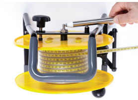
Figure 2 To Test the Entire System: Make sure sensitivity dial is turned fully clockwise. Touch the probe body to the standoff screw and probe tip to the stud (on axle) at the same time. The buzzer will sound if the system is okay.