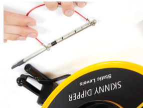
Figure 2 To Test the Entire System: Make sure sensitivity dial is turned fully clockwise. Touch one end of a conductive wire to the probe body and the other end to the last weight. This will create a short in the probe, the buzzer will sound if the system is okay.