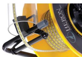
Image 2 Hanger to support the meter at the well head. Tape Guide to protect the tape from sharp edges.