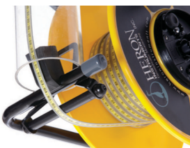
Figure 2 Tape Guide to protect the meter at the well head. Hanger to support the meter at the well head.