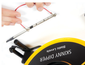
Figure 3 To Test the Entire System: Make sure sensitivity dial is turned fully clockwise. Touch one end of a conductive wire to the probe body and the other end to the last weight. This will create a short in the probe, the buzzer will sound if the system is okay.